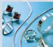
Ultrasonic cleaning in the jewellery branch