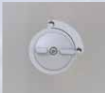
Knob for drain on side

The Elmasonic S units are available in 13 different sizes, ranging from 0.5 liter (approx. 0.1 gal or 0.5 quart) up to 90 liter (approx. 24 gal). They are equipped with efficient 37 kHz ultrasonic high-performance transducers of the latest generation.