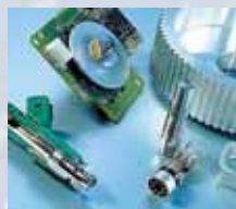
Cleaning of items in industry, workshops and service