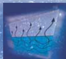
Degas and Autodegas

The basis of nearly perfect cleaning processes with ultrasound is the Elma high-performance transducer system with 37 kHz.