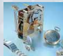
Ultrasound in the watch-maker branch

■ Laboratory: Ultrasound cleans wherever the cleaning liquid can go. It is particularly suitable for the cleaning of laboratory instruments made of glass, plastic or metal. Elmasonic S units degass HPLC solutions, mix, disperse, emulsify and dissolve specimens.