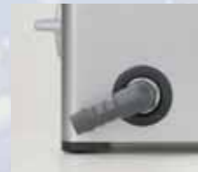
Positioned drain duct