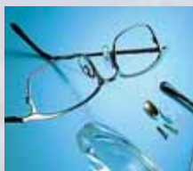
Ultrasound for ophthalmology and opticians