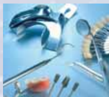
Cleaning in the dental and medical sectors