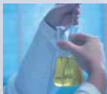
Cleaning, degassing and dispersing in the lab