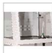
Back Side Air Compensation To avoid turbulence in work area