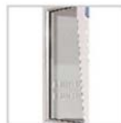
Observation Window Transparent side glass windows maximize light and visibility inside the cabinet