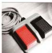
Foot Switch Use foot switch to adjust the height of front window.