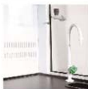
Water & Gas Tap Water Sink