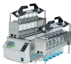
SpeedDigester K-439 / K-425 / K-436 IR digestion