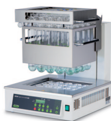
Digest Automat K-438 / K-432 / K-437 Block digestion