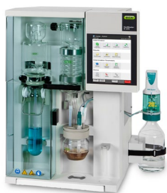
KjelMaster K-375 Steam distillation and titration