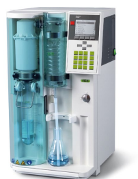
KjelFlex K-360 Steam distillation