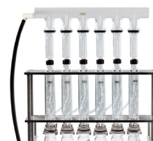
Reflux Setup Water or air reflux