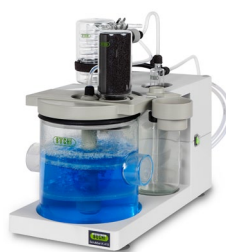
Scrubber K-415 Neutralization