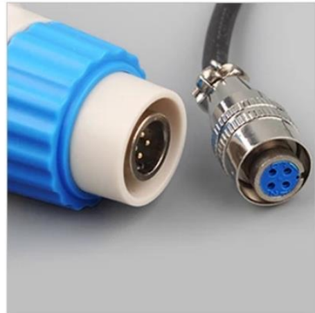
➤ Replaceable Sensor Probe Insert type design for convenient and fast replacement