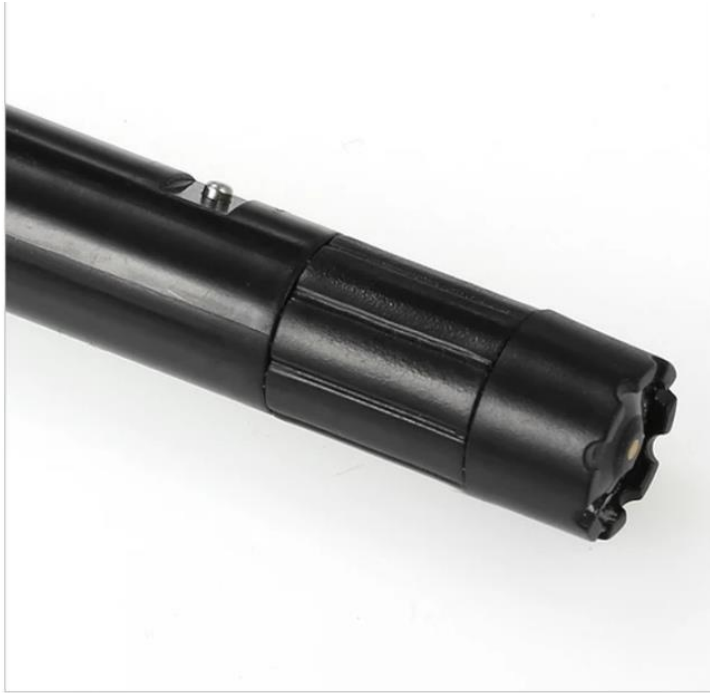
◀ High Sensitivity Probe Fast response & accurate measurement