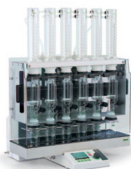
Extraction Unit E-816 Sox/HE Automated Soxhlet extraction