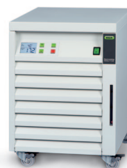
Recirculating Chiller F-108 Sustainable cooling