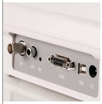
The FiveEasy Plus series meters allows data to be exported either directly to a printer or a PC for further processing using its RS232 or USB ports.

Fast Connectivity – Simple and Secure Data Transfer