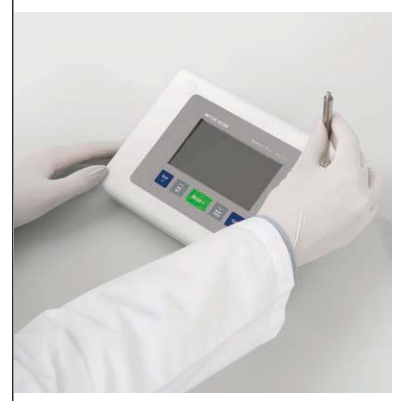
Thanks to its compact design, little bench space is needed for the Five series meters. The sensor holder can be easily removed and stored on the side of the meter after use.

Fast Connectivity – Simple and Secure Data Transfer