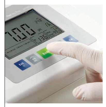
Intuitive Operation – Measurement Made Easy

Featuring a large, well-structured display for easy viewing, the instruments' intuitive button arrangement and simple menu ensure measurements can be performed in just a few clicks.